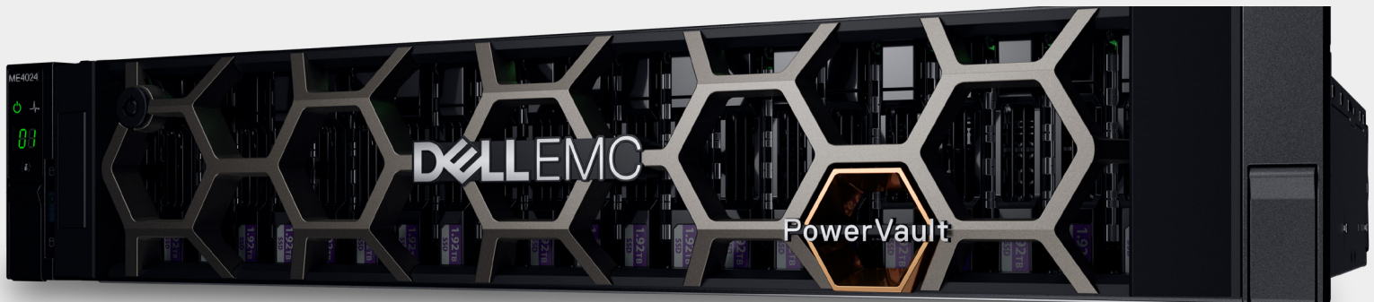
Dell EMC PowerVault ME4024

will work around security safeguards to get work done. 3